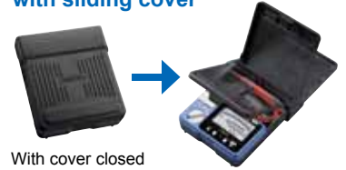
With cover closed